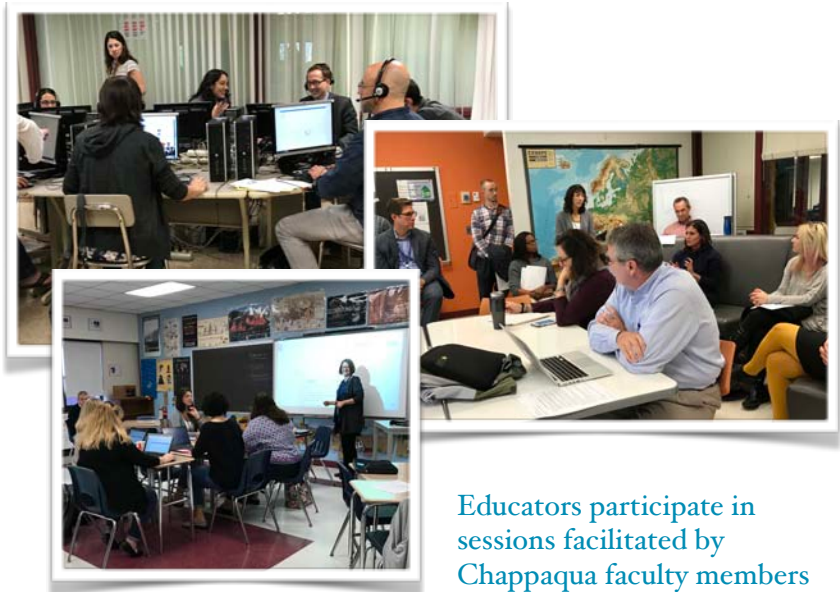
Educators participate in sessions facilitated by Chappaqua faculty members on October 27th.